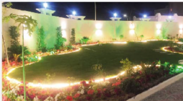
EDGE WITH LIGHT